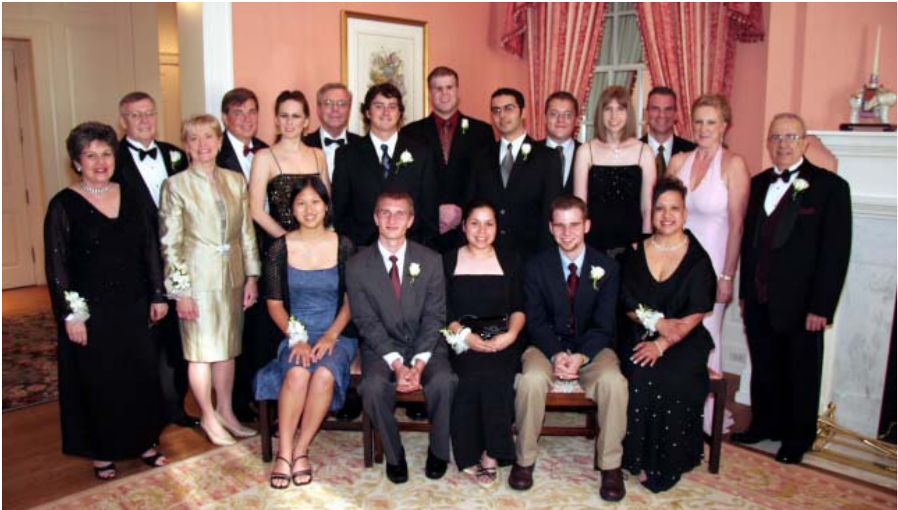
CSF Board with Students at the Fund Raising Gala - April 22, 2005

Working together, we are changing one life at a time.