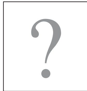
To be announced at the Gala Winner of 2006 Award